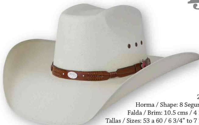
200x Horma / Shape: 8 Segundos Falda / Brim: 10.5 cms / 4 1/8" Tallas / Sizes: 53 a 60 / 6 3/4" to 7 1/2" Copa / Crown: 13.5 cms. / 5 5/16" Toquilla / Hatband: imitación tejida / Synthetic