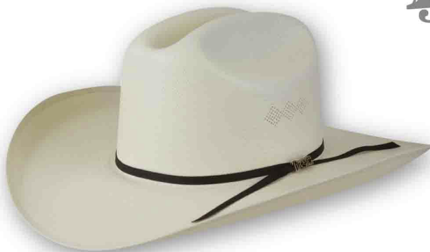
200x Horma / Shape: ranger Low Semi refaldeado Falda / Brim: 10 cms / 4" Tallas / Sizes: 53 a 60 / 6 3/4" to 7 1/2" Copa / Crown: 11 cms. / 4 5/16" Toquilla / Hatband: Biplay