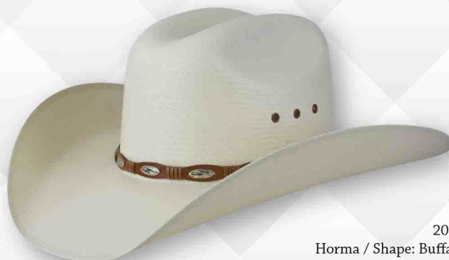
200x Horma / Shape: Buffalo Falda / Brim: 10.5 cms / 4 1/8" Tallas / Sizes: 53 a 60 / 6 3/4" to 7 1/2" Copa / Crown: 11 cms. / 4 5/16" Toquilla / Hatband: Conchos finos / Hardware