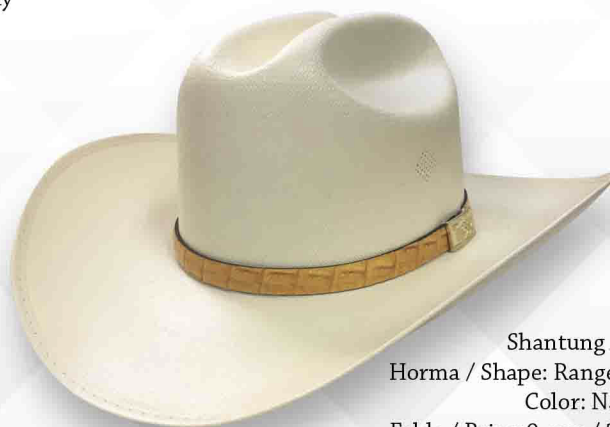
500x Shantung A 2x2 Horma / Shape: RangerLow Color: Natural Falda / Brim: 9 cms / 3 1/2" Tallas / Sizes: 53 a 60 / 6 3/4" to 7 1/2" Copa / Crown: 10.5 cms. / 4 1/8" Toquilla / Hatband: imitación / Synthetic