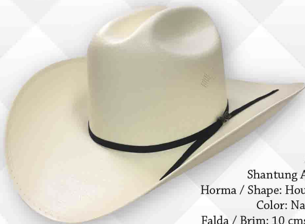
500x Shantung A 2x2 Horma / Shape: Houston Color: Natural Falda / Brim: 10 cms / 4" Tallas / Sizes: 53 a 60 / 6 3/4" to 7 1/2" Copa / Crown: 10.5 cms. / 4 1/8" Toquilla / Hatband: Biplay