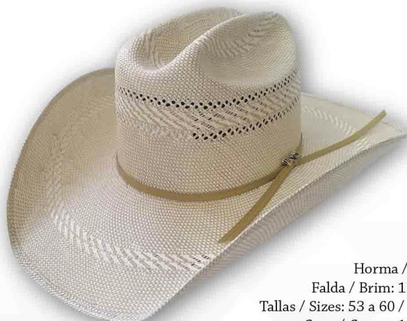
Braford 200x Horma / Shape: Arizona Falda / Brim: 10.5 cms / 4 1/8" Tallas / Sizes: 53 a 60 / 6 3/4" to 7 1/2" Copa / Crown: 11 cms. / 4 5/16" Toquilla / Hatband: Biplay