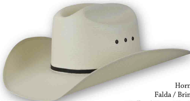
200x Horma / Shape: Arizona Falda / Brim: 10.5 cms / 4 1/8" Tallas / Sizes: 53 a 60 / 6 3/4" to 7 1/2" Copa / Crown: 11 cms. / 4 5/16" Toquilla / Hatband: Biplay