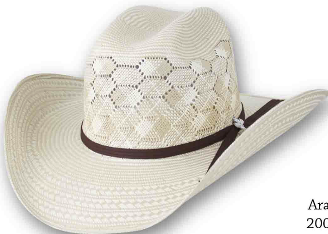
Arab 200x Horma / Shape: Buffalo Falda / Brim: 10.5 cms / 4 1/8" Tallas / Sizes: 53 a 60 / 6 3/4" to 7 1/2" Copa / Crown: 11 cms. / 4 5/16" Toquilla / Hatband: Biplay