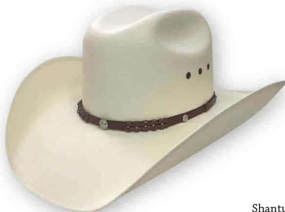
500x Shantung A 2x2 Horma / Shape: Buffalo Color: Natural Falda / Brim: 10.5 cms / 4 1/8" Tallas / Sizes: 53 a 60 / 6 3/4" to 7 1/2" Copa / Crown: 11.5 cms. / 4 1/2" Toquilla / Hatband: Imitación Piel Tejida / Synthetic woven