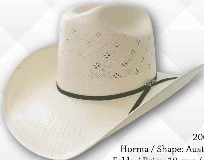
200x Horma / Shape: Austin Falda / Brim: 10 cms / 4" Tallas / Sizes: 53 a 60 / 6 3/4" to 7 1/2" Copa / Crown: 13 cms. / 5 1/4" Toquilla / Hatband: Biplay