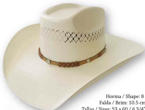
200x Horma / Shape: 8 Segundos Falda / Brim: 10.5 cms / 4 1/8" Tallas / Sizes: 53 a 60 / 6 3/4" to 7 1/2" Copa / Crown: 13.5 cms. / 5 5/16" Toquilla / Hatband: imitación tejida / Synthetic