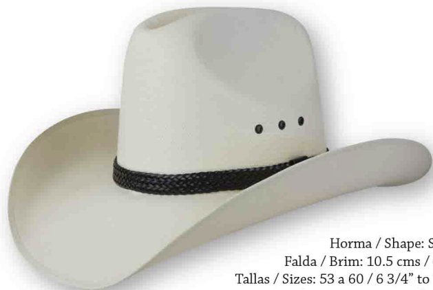
200x Horma / Shape: Sonora Falda / Brim: 10.5 cms / 4 1/8" Tallas / Sizes: 53 a 60 / 6 3/4" to 7 1/2" Copa / Crown: 13.5 cms. / 5 5/16" Toquilla / Hatband: imitación tejida / Synthetic