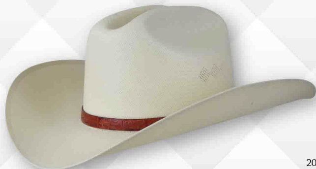
200x Horma / Shape: Reanger Low Semi Plano Falda / Brim: 10 cms / 4" Tallas / Sizes: 53 a 60 / 6 3/4" to 7 1/2" Copa / Crown: 11 cms. / 4 5/16" Toquilla / Hatband: Imitación piel / Synthetic