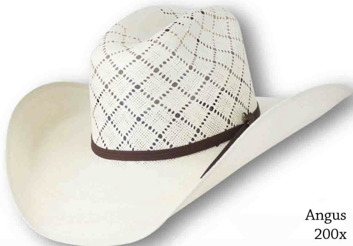
Angus 200x Horma / Shape: Buffalo Falda / Brim: 10.5 cms / 4 1/8" Tallas / Sizes: 53 a 60 / 6 3/4" to 7 1/2" Copa / Crown: 11 cms. / 4 5/16" Toquilla / Hatband: Biplay