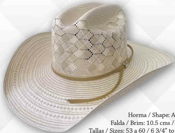
Arab 200x Horma / Shape: Arizona Falda / Brim: 10.5 cms / 4 1/8" Tallas / Sizes: 53 a 60 / 6 3/4" to 7 1/2" Copa / Crown: 11 cms. / 4 5/16" Toquilla / Hatband: Biplay