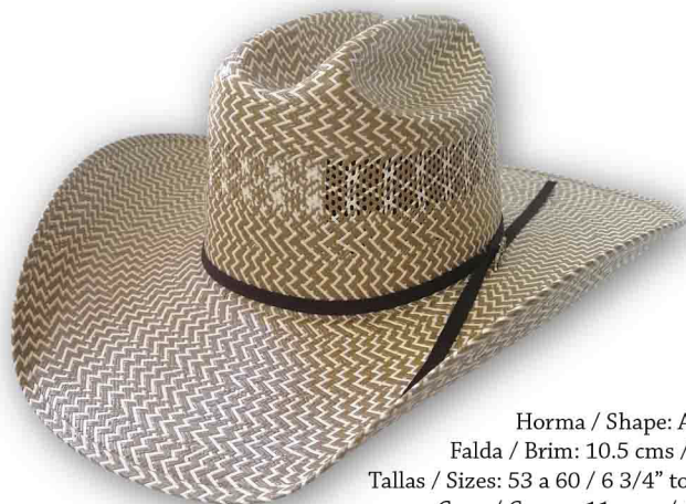
Barret 200x Horma / Shape: Arizona Falda / Brim: 10.5 cms / 4 1/8" Tallas / Sizes: 53 a 60 / 6 3/4" to 7 1/2" Copa / Crown: 11 cms. / 4 5/16" Toquilla / Hatband: Biplay