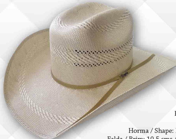
Braford 200x Horma / Shape: Buffalo Falda / Brim: 10.5 cms / 4 1/8" Tallas / Sizes: 53 a 60 / 6 3/4" to 7 1/2" Copa / Crown: 11 cms. / 4 5/16" Toquilla / Hatband: Biplay