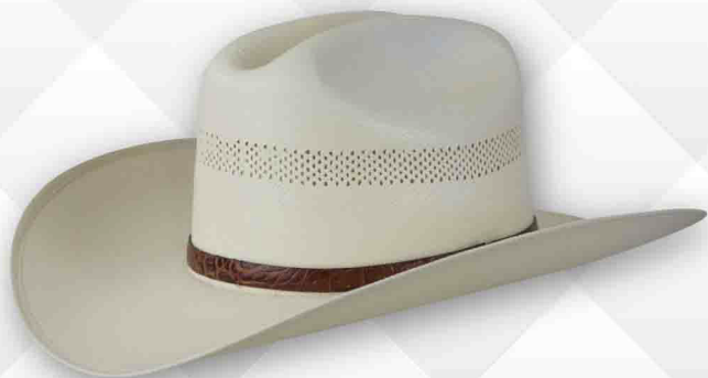
200x Horma / Shape: ranger Low Semi refaldeado Falda / Brim: 10 cms / 4" Tallas / Sizes: 53 a 60 / 6 3/4" to 7 1/2" Copa / Crown: 11 cms. / 4 6/16" Toquilla / Hatband: imitación Pien / Synthetic