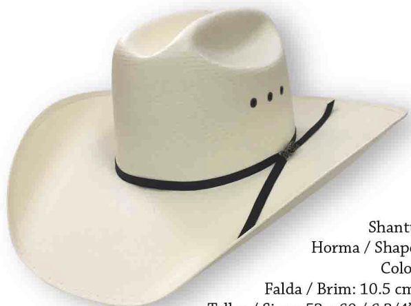
500x Shantung A 2x2 Horma / Shape: Arizona Color: Natural Falda / Brim: 10.5 cms / 4 1/8" Tallas / Sizes: 53 a 60 / 6 3/4" to 7 1/2" Copa / Crown: 10.5 cms. / 4 1/8" Toquilla / Hatband: Biplay