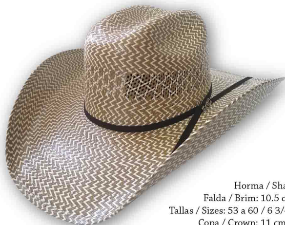
Barret 200x Horma / Shape: Buffalo Falda / Brim: 10.5 cms / 4 1/8" Tallas / Sizes: 53 a 60 / 6 3/4" to 7 1/2" Copa / Crown: 11 cms. / 4 5/16" Toquilla / Hatband: Biplay