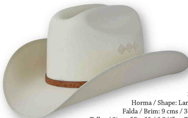
300x Horma / Shape: Laramie Falda / Brim: 9 cms / 3 1/2" Tallas / Sizes: 53 a 60 / 6 3/4" to 7 1/2" Copa / Crown: 11.5 cms. / 4 1/2" Toquilla / Hatband: Imitación piel / Synthetic