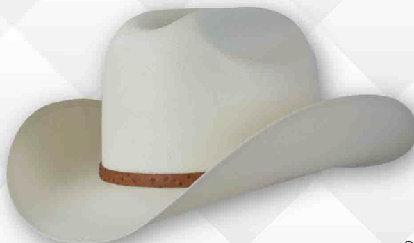
200x Horma / Shape: Laramie Falda / Brim: 9 cms / 3 1/2" Tallas / Sizes: 53 a 60 / 6 3/4" to 7 1/2" Copa / Crown: 12 cms. / 4 3/4" Toquilla / Hatband: imitación Pien / Synthetic